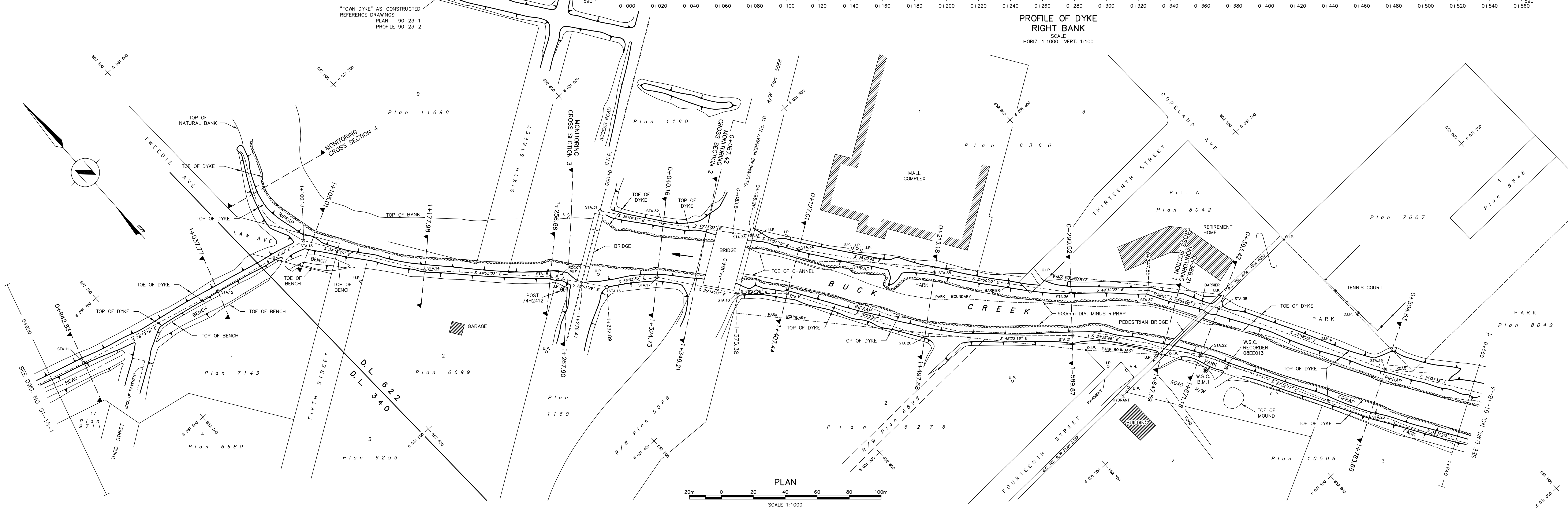
PLAN SCALE 1:1000