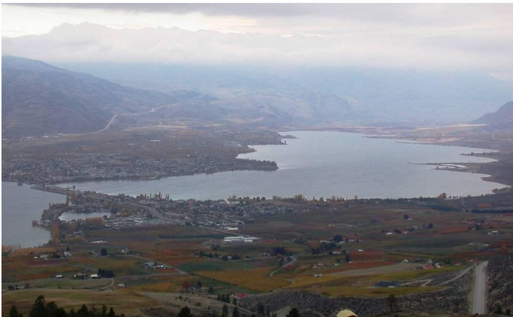
Figure 5. A view of Osoyoos and part of Osoyoos Lake in 2002 showing development around the two ponded areas; the ponded area to the right has had many more buildings constructed along it since 2002 (T. McIntosh).