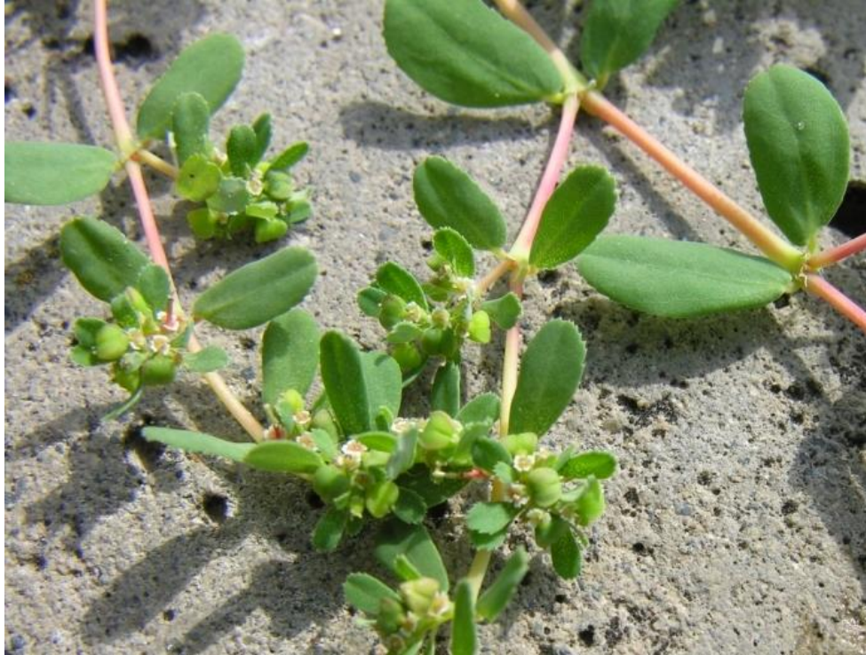
Figure 1. Thyme-leaved spurge (September 14, 2009; T. McIntosh).