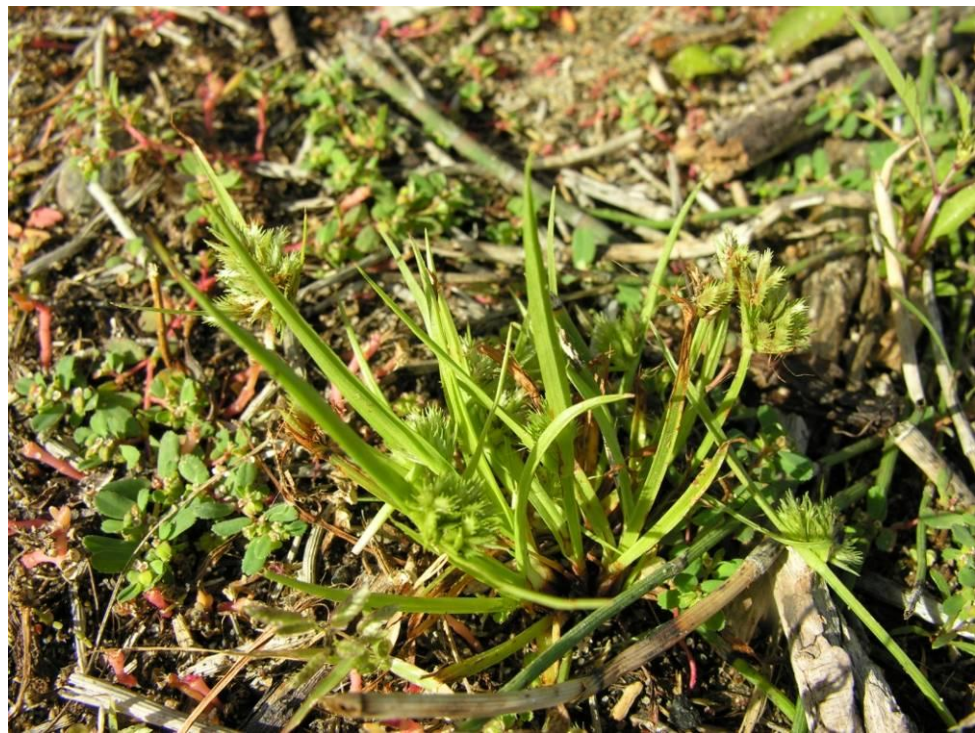
Figure 2. Awned cyperus growing with thyme-leaved spurge (September 14, 2009; T. McIntosh).