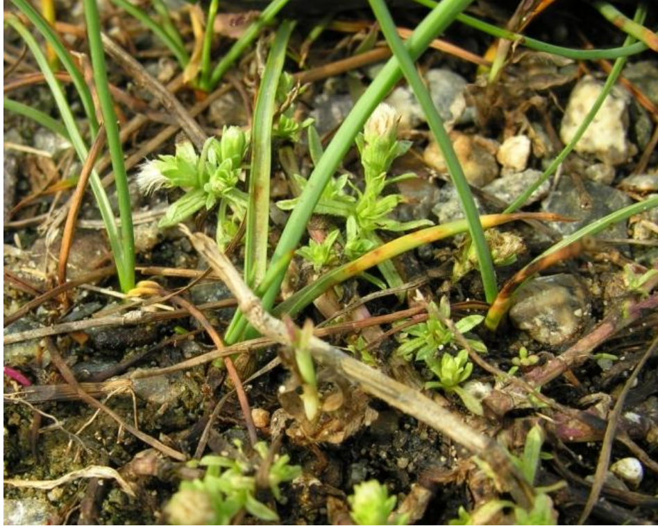
Figure 3. Short-rayed alkali aster (September 14, 2009; T. McIntosh).