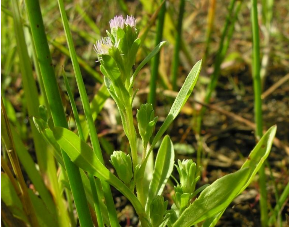
Short-rayed Alkali Aster (SARA Endangered) along west side of Osoyoos Lake Sept. 14, 2009 (T. McIntosh).