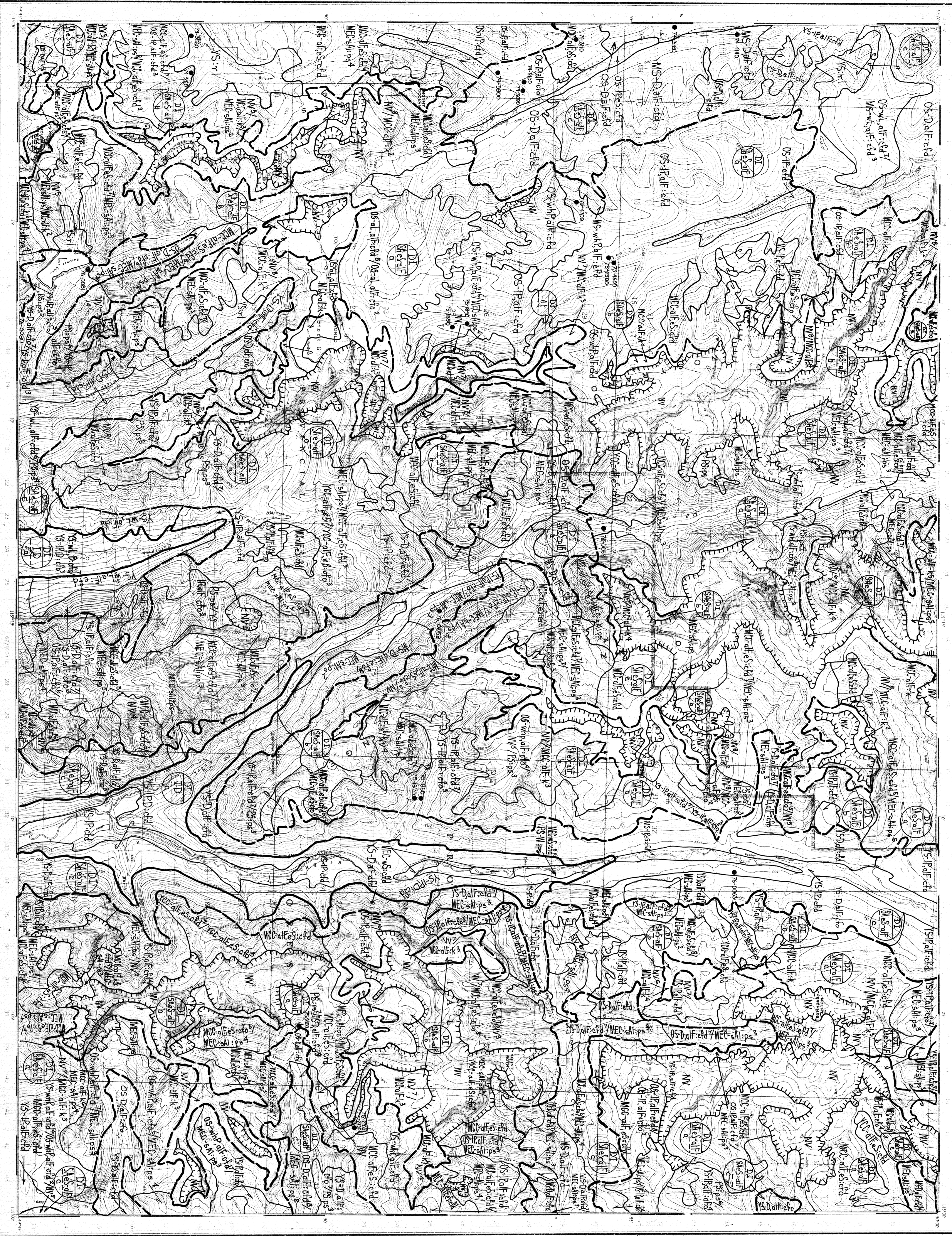
QUINN CREEK KOOTENAY DISTRICT BRITISH COLUMBIA SCALE 1:50,000 FOHELE