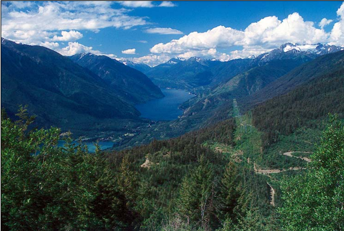
Figure 3. Southeast view of Anderson Lake; note the habitat alteration from hydro and forestry related development.

The detection of other owl species during the surveys provided initial information regarding the distribution of owl species within BCRP's footprint area. As these owl species were not specifically targeted during call-playback surveys population estimates cannot be inferred. In addition to the benefit of collecting information on the local Spotted Owl population within the study area, opportunistic observations of two other rare species were also recorded: