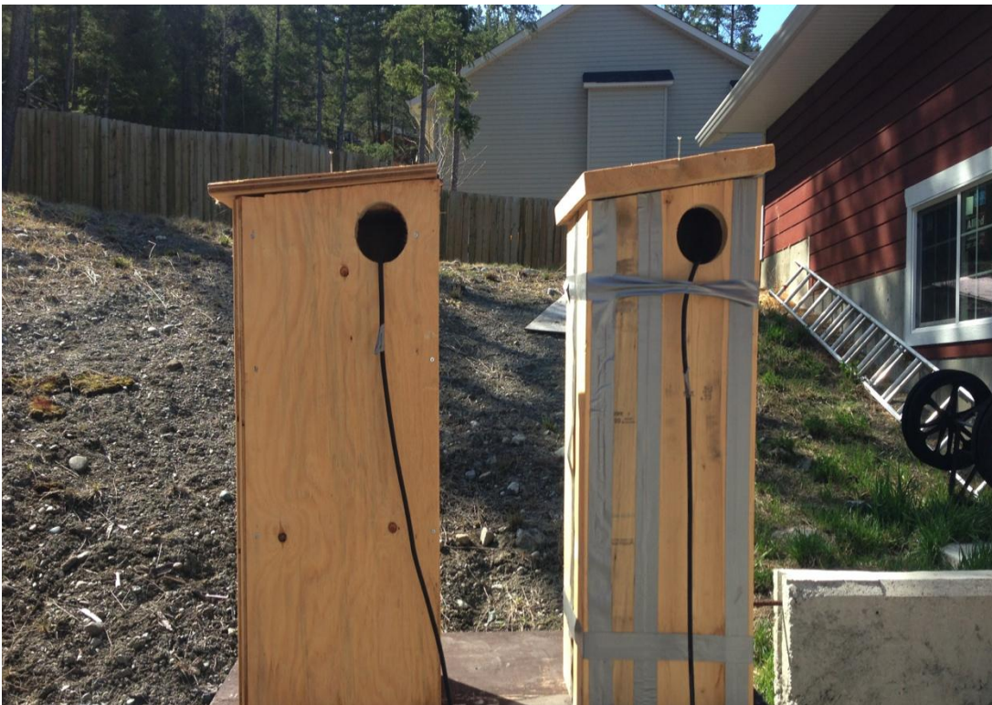
Figure 2. Comparison of thermal properties between the two den box designs.