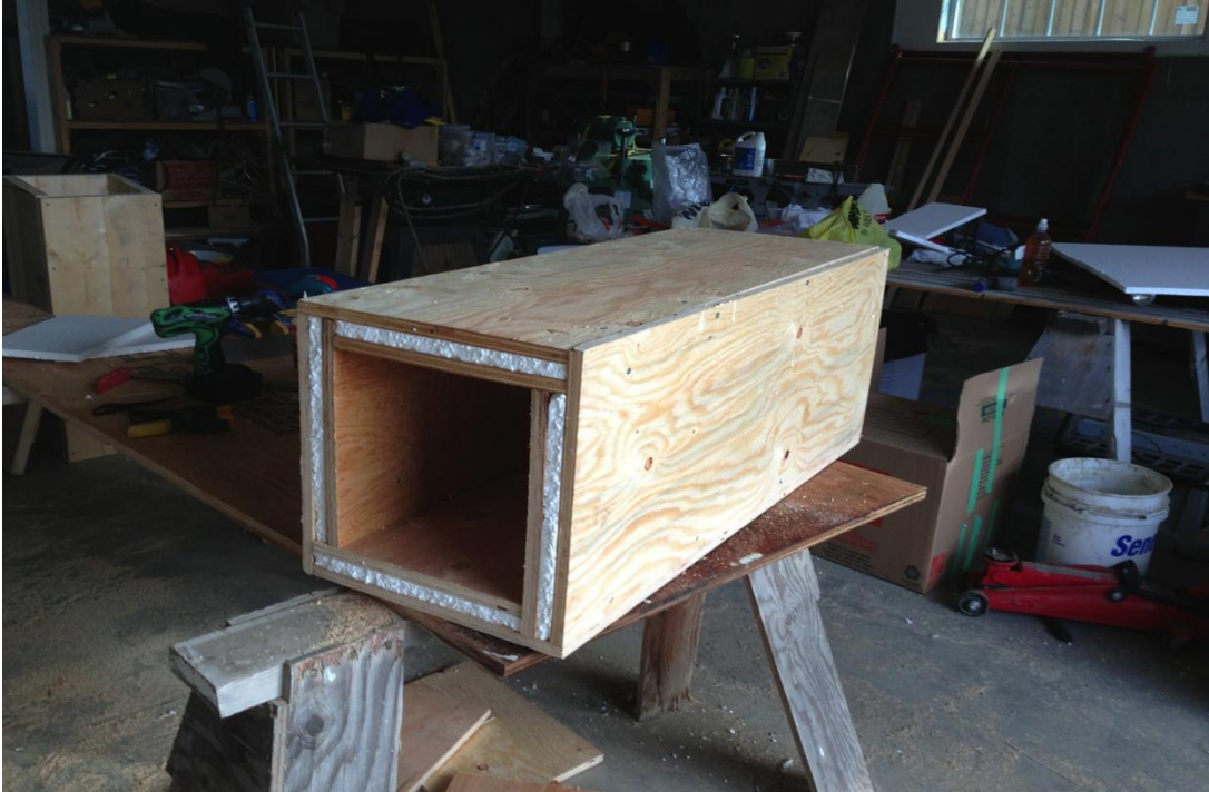
Figure 1. Wafer design for den box with 19 mm insulation layered between 19 mm plywood.