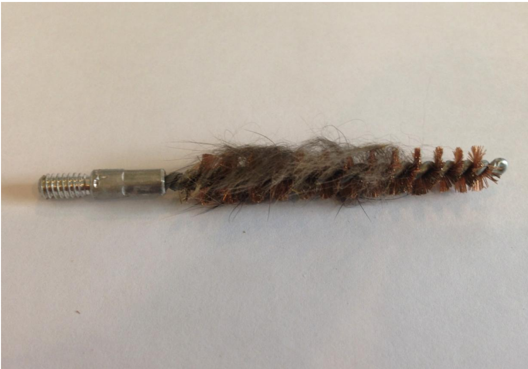
Figure 6. Detail of bore brush with hair sample from the 2013-14 Bridge Watershed.