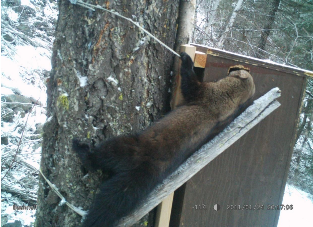
Figure 8. Fisher looking into den box (DB9) near the Yalakom River.