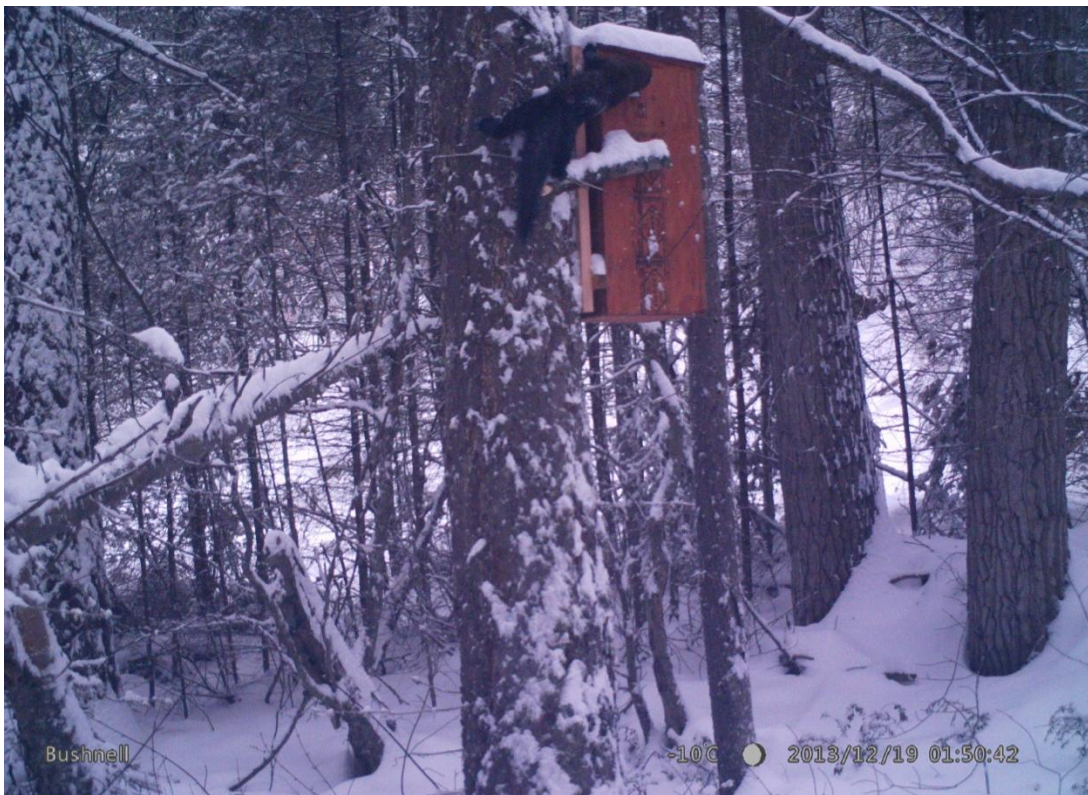
Figure 9. Fisher looking into den box (DB23) near Tyaughton Lake.