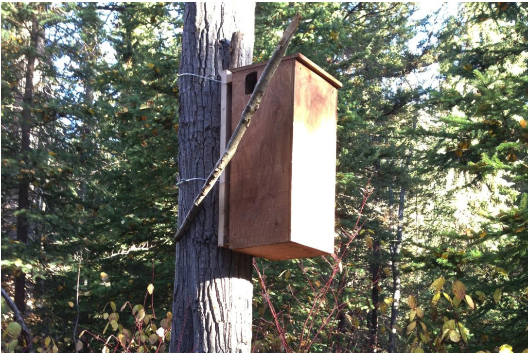
Figure 4. Wafer plywood design den box mounted on tree using plastic coated wire and clamps.