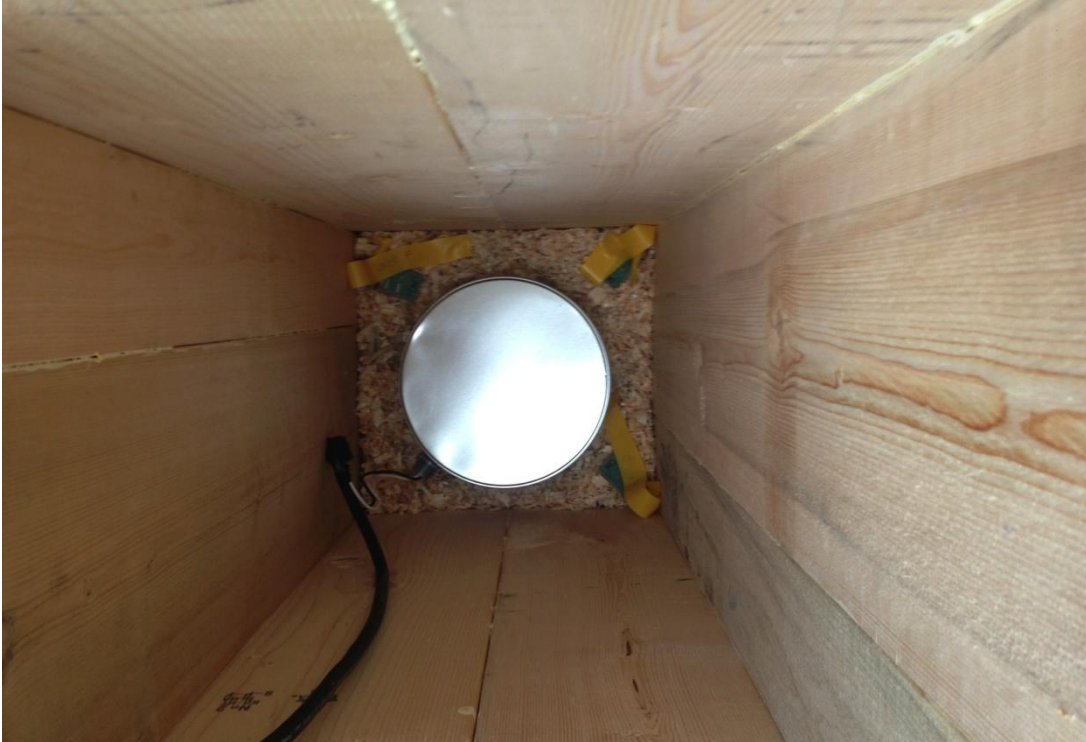
Figure 3. Tin box housing 7.5 W light bulb and thermocouples used to test thermal regime of the boxes.