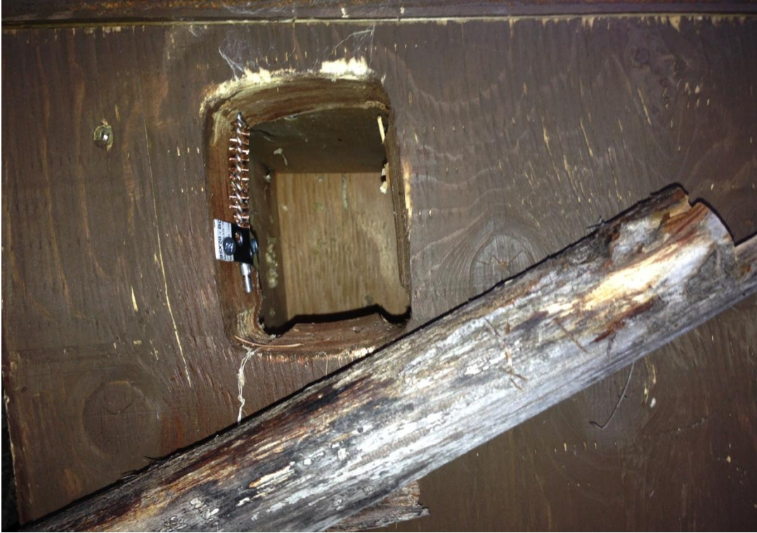
Figure 5. Detail of bore brush installed to collect hair from animals entering the den box.