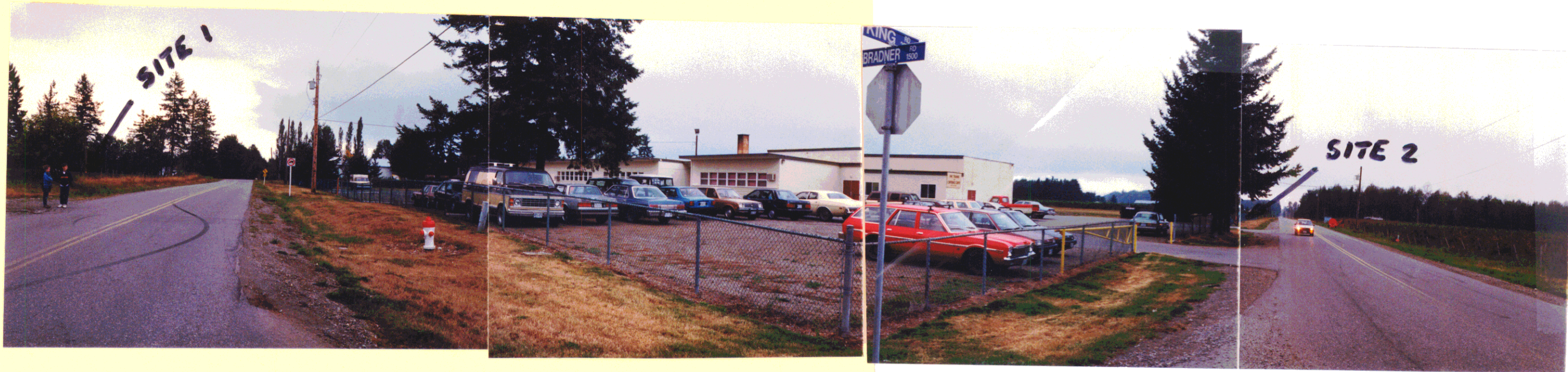
PAN VIEW FROM KING & BRADNER INTERSECTION SHOWING BOTH PROPOSED DRILL SITES.