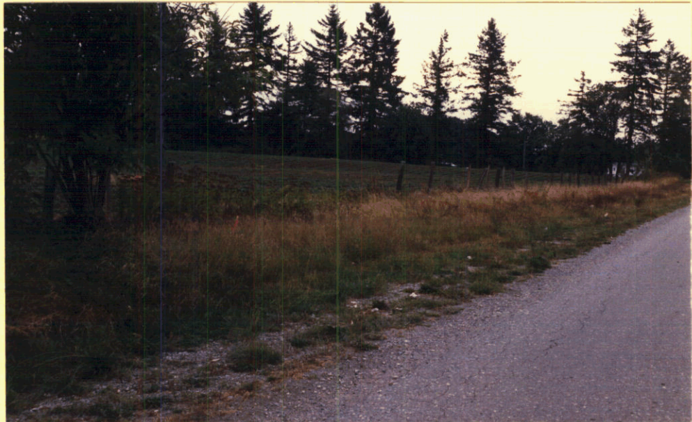
LOOKING SOUTH AT SITE 1 FROM BRADNER RD.