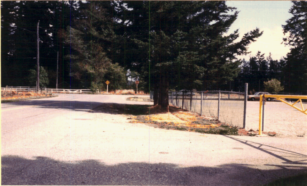
LOOKING EAST AT SITE 2 TOWARDS KING & BRADNER INTERSECTION