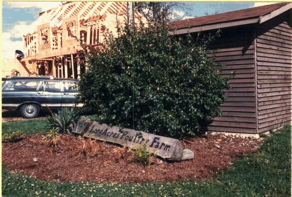
NEW HOME BEING BUILT NEXT TO K. SPENCER'S WELL