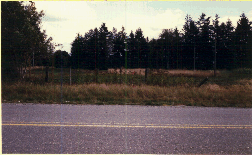
LOOKING EAST AT SITE 1 FROM BRADNER RD.