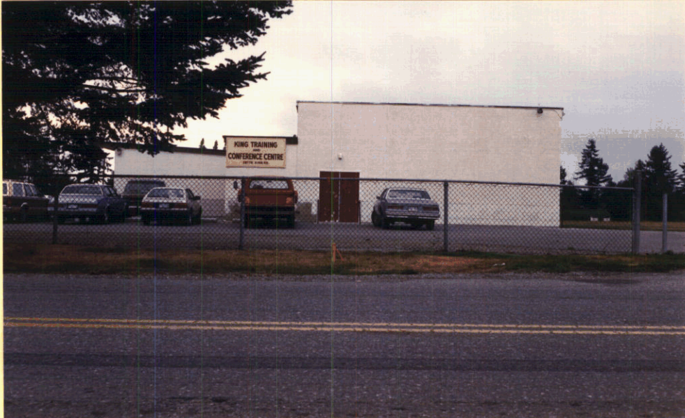
LOOKING SOUTH AT SITE 2 FROM KING RD.