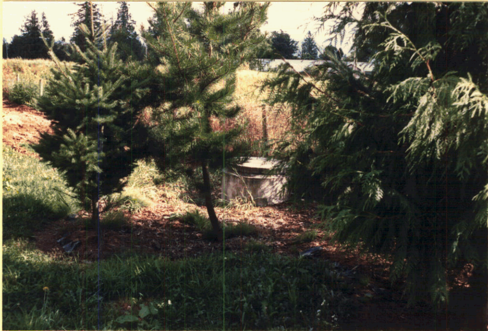
KIRSTEN SPENCER'S WELL - LOOKING EAST FROM FENCE ALONG BRADNER RD.