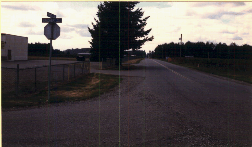
LOOKING WEST AT SITE 2 ON KING RD.