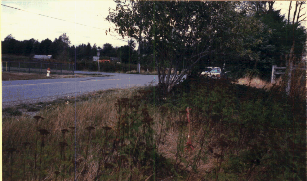
LOOKING AT PREFERRED DRILL SITE ON BRADNER RD. TOWARDS INTERSECTION OF KING & BRADNER RD.