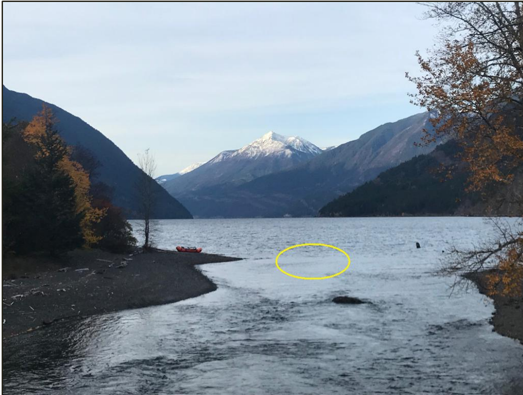
Photo 3. The area circled in yellow denotes an optimal broodstock collection location know as the ‘upper slot’. The ‘upper slot’ is described as a shelf of the right-bank shoreline, immediately downstream of the Anderson Lake outlet, which is just in reach of net setting capabilities.