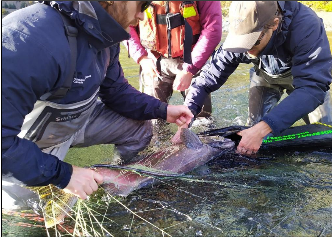
Photo 10. A freshly captured Portage Creek Chinook male being transferred from the tangle net to a broodstock bag for temporary holding prior to on-site gamete collection, October 2020.

Also crucial to this year's success and logistical feasibility was FWCP's ancillary contribution to help secure adequate accommodations. Due to health and safety concerns surrounding the COVID-19 pandemic, BC Hydro accommodations were heavily restricted and not available to DFO staff. With all hotels fully booked, the only adequate option to ensure that the project could proceed successfully was securing trailers at a local campground. Thanks to FWCP, this was made possible. The accommodations provided adequate sleeping quarters for a required field crew of four to five, as well as a fridge-freezer unit, which was imperative for safely storing the numerous tissue samples that were collected until they could be shipped to the Fish Health Diagnostics Lab in Nanaimo for analysis. As such, a similar broodstock collection effort of two week's time in the second half of October and the securing of similar accommodations with fridges and freezers are likely required to ensure repeated program success in 2021.