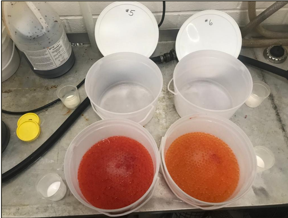
Photo 2. Gametes (eggs and milt) from 2020 broodstock (safely transported from Portage Creek back to Tenderfoot Creek Hatchery) immediately prior to fertilization.

The primary location used for adult broodstock collection was the outlet of Anderson Lake (Figure 2). This location was originally suggested by DFO Science Branch Stock Assessment technicians who were experienced surveyors of Portage Creek. The vast majority of successfully collected Chinook broodstock to date have come from this location.