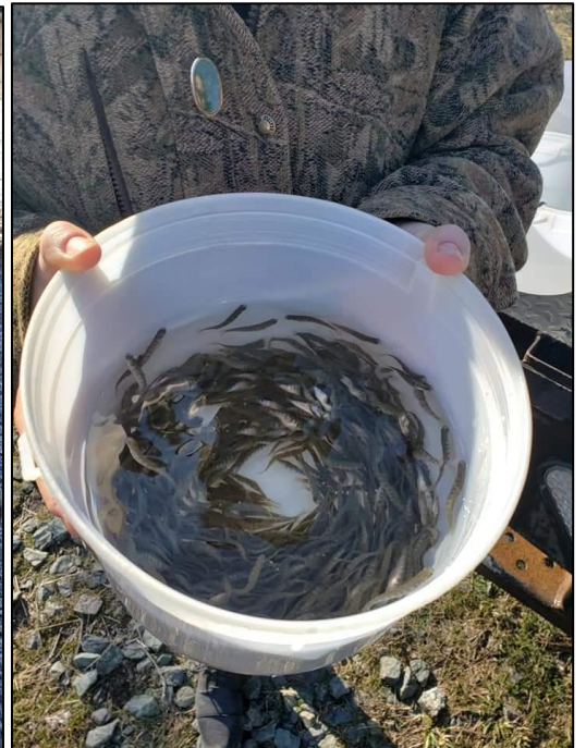
Photos 4-7. Portage Creek Chinook fry release, Feb 19 th , 2020.