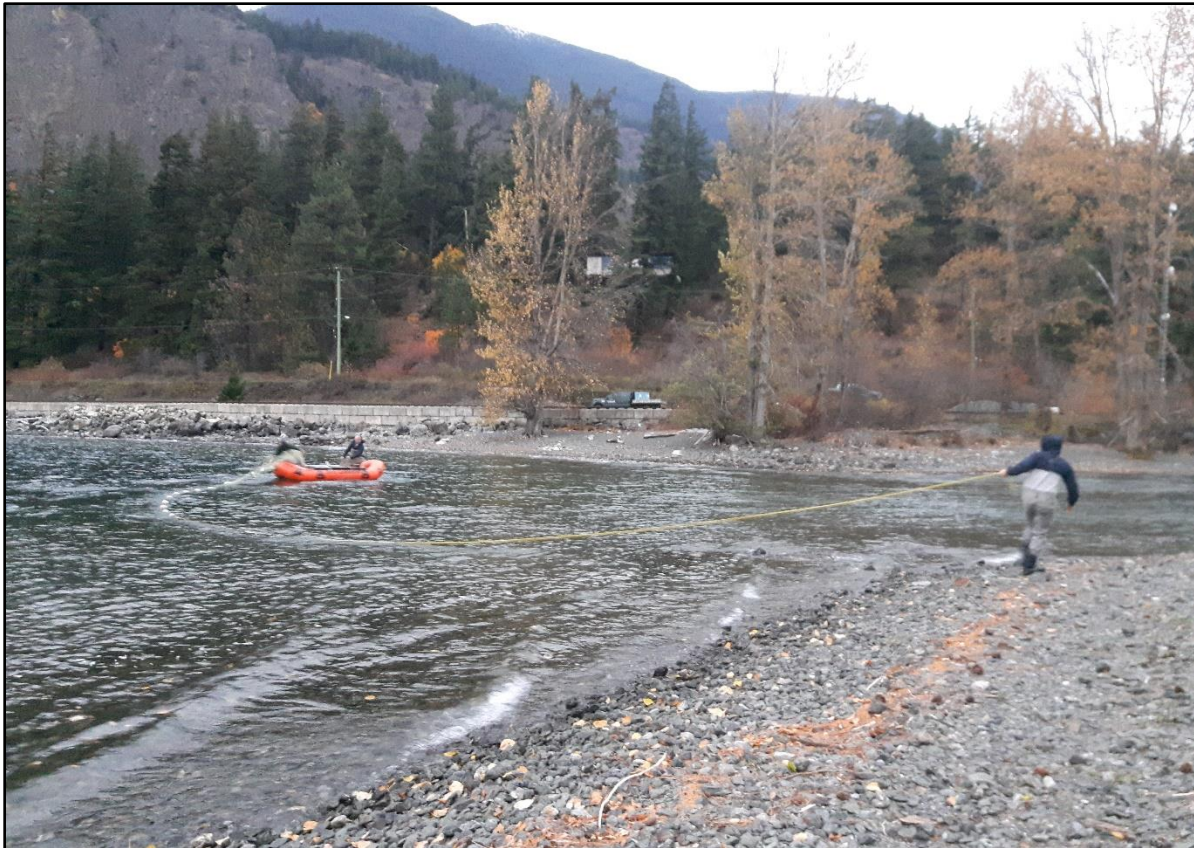
Photos 8 and 9. Images comparing the different broodstock collection methodologies, with photo 8 (top) depicting the set net method used in 2018, and photo 8 (bottom) capturing the highly successful modified beach seine method used in 2019 and 2020.