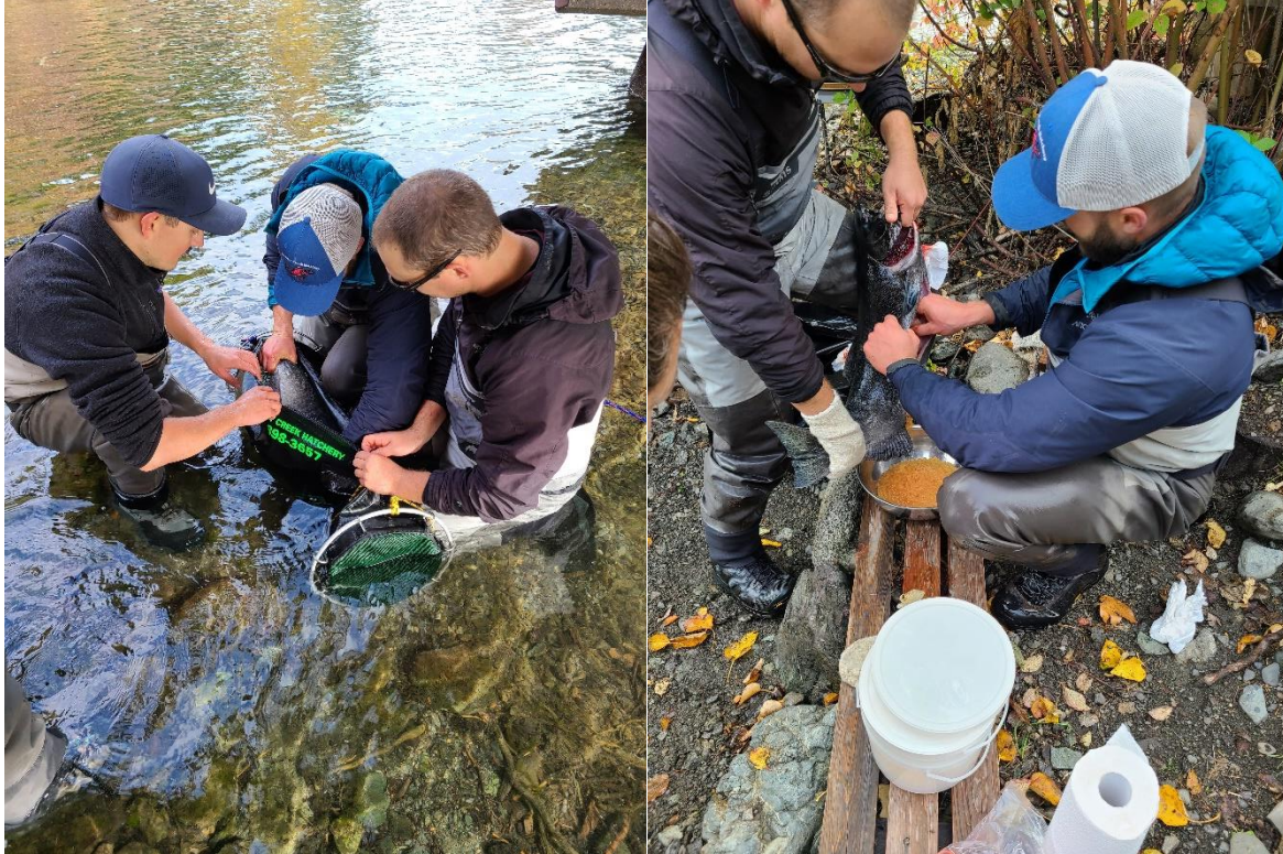
Photo 1. Brood being stored in a holding tube in Portage Creek (left) and Tenderfoot Creek Hatchery staff performing an egg take (right).