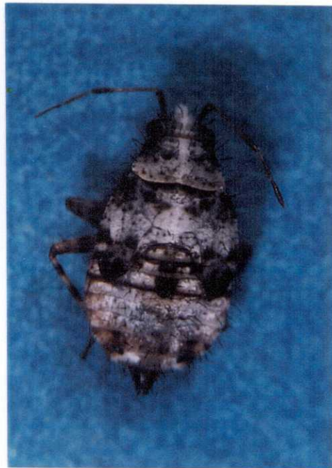
Figure 19 - Predaceous plant bug nymph.