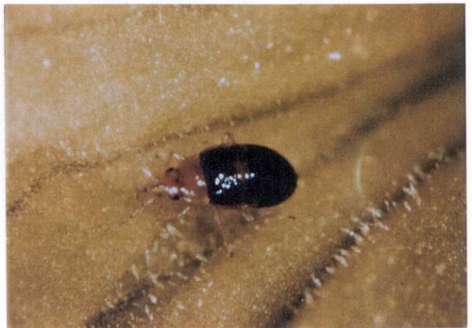
Figure 16 - Minute pirate bug nymph.