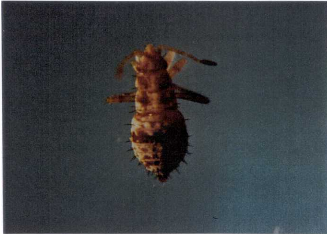
Figure 18 - Predaceous plant bug nymph.