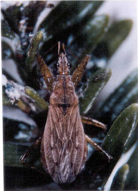
Figure 11 - Damsel bug.

Immatures Nymphs resemble small, pale adults without wings.