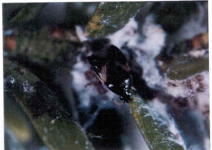
Figure 14 - Minute pirate bug.