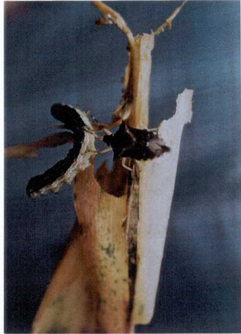
Figure 9 - Spined soldier bug with prey.

Immatures Nymphs resemble small adults without wings.