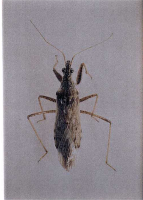
Figure 10 - Damsel bug.