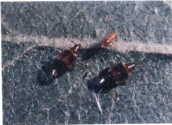
Figure 15 - Minute pirate bug nymphs.