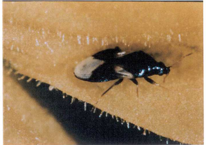
Figure 13 - Minute pirate bug.

Nymphs 2-4 mm. Shiny, wingless, yellowish-pink to reddish-brown (Figs. 15 and 16).