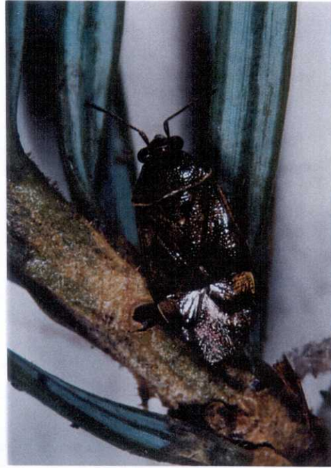
Figure 17 - Predaceous plant bug.

Nymphs 4 mm. Pink to light grey with dark markings (Figs. 18 and 19), able to use rectum for extra footing.