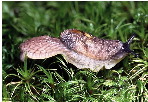
Figure 2. Warty Jumping-slug (Mount Brenton, Vancouver Island, 2001).