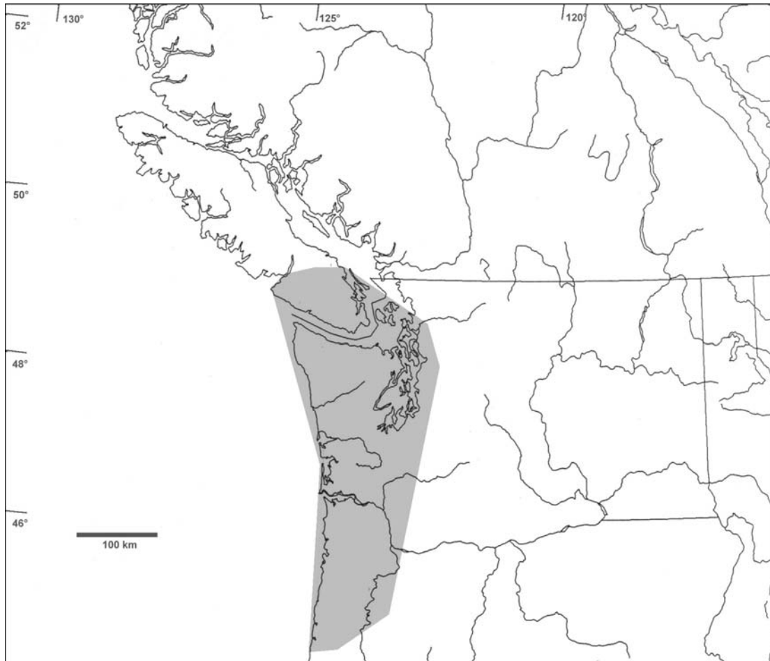
Figure 3. North American distribution of Warty Jumping-slug (COSEWIC 2003).

In Canada, Warty Jumping-slug is known from the southern third of Vancouver Island (Figure 4). The estimated extent of occurrence in B.C. is approximately 4700 km 2 , but the area of occupancy is a small fraction of this range (about 20–100 km 2 ) although it cannot accurately be estimated at this time. As of September 2011, there are 16 extant locations 2 , most of which are on the west coast of Vancouver Island, from Barclay Sound south to Sooke Inlet (Table 1). Two locations on the east coast of Vancouver Island (Cowichan River and Nanaimo Lakes) are considered historic locations and because of lack of specific information pertaining to the exact spatial location, continued presence at these two locations is difficult to determine. No records exist from mainland B.C. (B.C. Conservation Data Centre 2011).