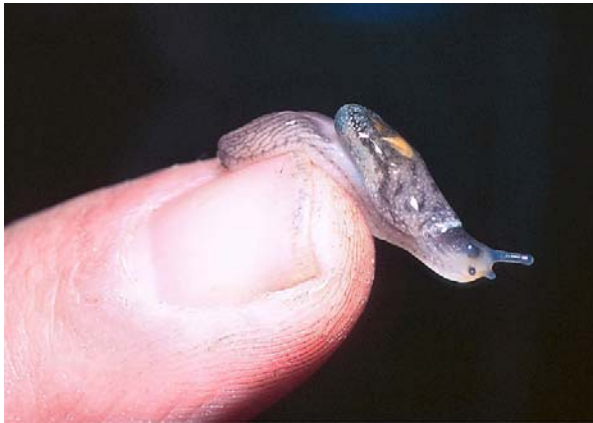
Figure 1. Warty Jumping-slug (Carmanah Valley, Vancouver Island, 2000).

Warty Jumping-slug is one of seven described species of jumping-slugs endemic to western North America (family Arionidae: genus Hemphillia ) (Turgeon et al. 1998). No subspecies of Warty Jumping-slug have been recognized, but recent molecular studies have revealed much genetic fragmentation among populations from different geographic areas, suggesting the nominal species H. glandulosa may represent a complex of sister species (Wilke 2004).