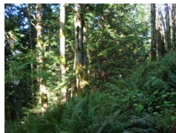
Figure 6. Moist second-growth habitat with red alder and bigleaf maple near East Sooke; Anderson Cove location. Note dense understory of sword fern.

This remnant patch was surrounded by recently harvested cutblocks. Five Warty Jumping-slugs were found within 2-person hours of intensive search. Several small creeks and pools of water were present in the patch. The forest floor was moist and contained abundant, layered coarse woody debris including large-diameter decaying logs.