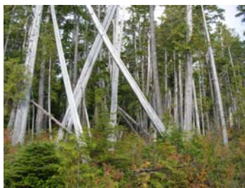
Figure 5. A remnant patch of western redcedar and western hemlock old-growth forest at Noyse Creek North, outside of Port Renfrew.

Both suitable forest structure and microhabitat conditions are essential for population persistence of Warty Jumping-slug over the long term. Key habitat features include moist forest floor conditions, abundant coarse woody debris, deep litter or moss layer that holds moisture, and shade provided by the forest canopy. Coarse woody debris at variable states of decay provides shelter, egg-laying sites, and a source of moisture for slugs. Across the landscape, suitable habitats must be connected to facilitate colonization of new habitats, repopulation of habitat patches from which the species might have disappeared, and genetic exchange that maintains variability and ability of populations to adapt to changing conditions. The dispersal ability of the Warty Jumping-slug is thought to be poor and is probably hindered by open habitats that do not maintain high humidity and moisture. Such habitats include recently logged areas and other disturbed habitats, especially at drier locations and within the heavily fragmented low-elevation coniferous forests of southern Vancouver Island.