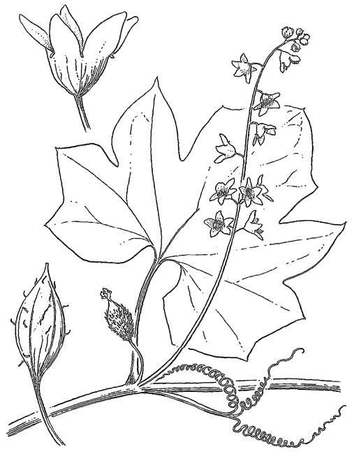
Figure 1. Illustration of manroot (Hitchcock et al. 1959). Published with permission of University of Washington Press.

Coast manroot is a perennial vine from a large, woody root with herbaceous annual stems that are climbing or trailing bearing branched tendrils. Leaves are alternate, up to 20 cm long, glossy green, and palmately lobed (5–7 lobes). Leaf bases are shallowly lobed and cordate (heart-shaped). Leaves are stalked and bristly above and sparsely hairy below. Its white flowers are monoecious, with separate male and female flowers on the same plant. Male flowers are arranged in racemes (elongate unbranched inflorescences) or panicles (branched inflorescences) arising from the leaf axils. Female flowers are on short pedicels, individually arising from the leaf axils at the base of the male inflorescence. Male flowers are 3–15 mm wide, cup-shaped, white to cream or yellow-green, with 5–8 lobes. Fruits are green with dark green stripes, weakly spiny, elliptic to egg-shaped, up to 4–5 cm in diameter, and tapering to a slight beak. Seeds are 1–2 in each locule, 16–22 mm long, disk-shaped, and flattened (Douglas et al. , eds. 1998; Miller and Schlising 2012).